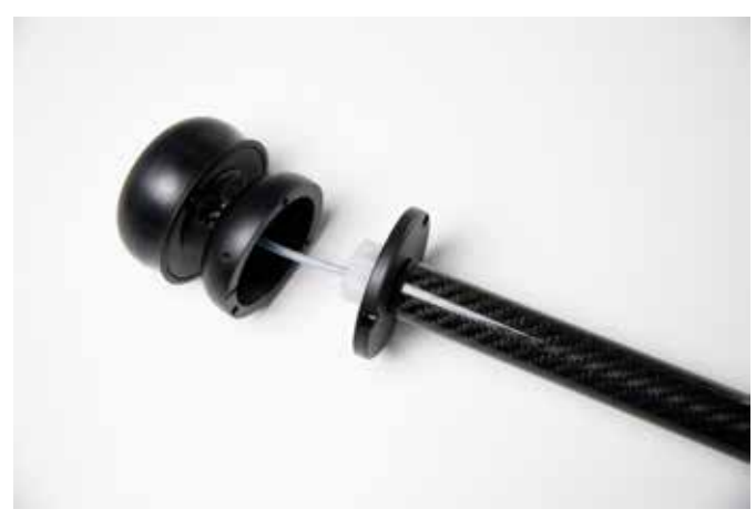
*Non applicable to the ULTRASONIC NMEA 2000 model.