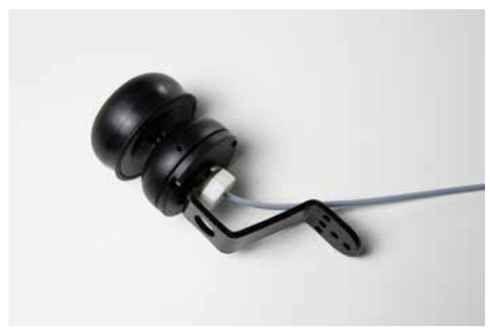
*Non applicable to the ULTRASONIC NMEA 2000 model.