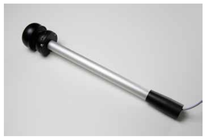
*Non applicable to the ULTRASONIC NMEA 2000 model

3.8. Firmware Upgradable via RS485, MODBUS, UART/TTL or NMEA 2000.